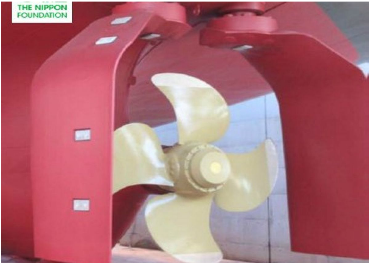
The Gate Rudder system is an example of an Open Type Ducted Propeller.